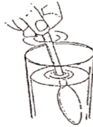
Figure 2. Mix dose in beverage or infant formula.

It is recommended that approximately half of your dosage be taken at the beginning of each meal or snack and the remainder of your dosage be taken during the meal or snack.